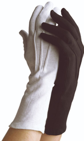
Long-wristed Cotton Gloves ( White Only! For Brass Instruments)

*Wide widths available in Men's 6½ to 11½, 12, 13, 14 and Women's 8½ to 11½