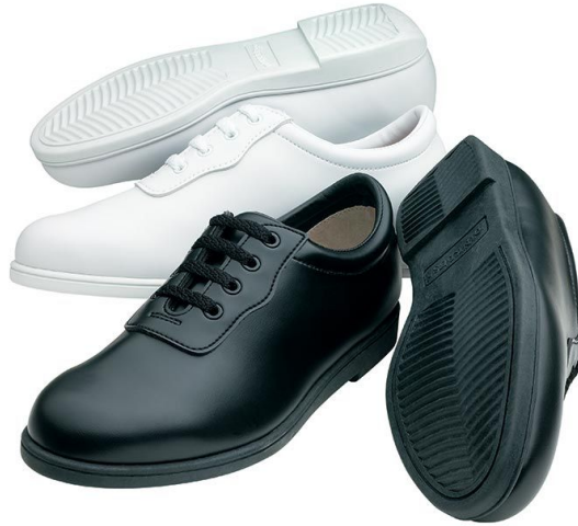
Glide Marching Shoe ( Black Only )